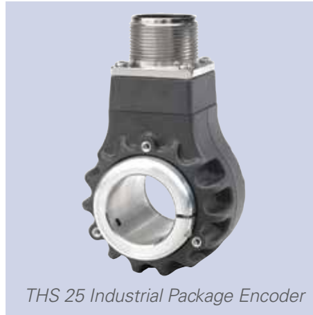
THS 25 Industrial Package Encoder

Customers rely on Timken for value-added solutions. The standard M15 Modular Magnetic Encoder offers a range of resolutions in a ready-to-mount kit that includes the circuit board and target. THS25 packaged encoders provide reliable speed and position sensing for a variety of applications including motor and vector control. Timken application engineers also work with customers to develop customized