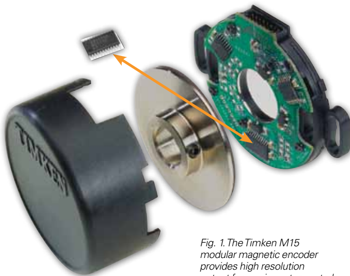
Fig. 1. The Timken M15 modular magnetic encoder provides high resolution output for use in motor control.

The Timken M15 modular magnetic encoder is a high-resolution speed and position feedback sensor used in electrical motors and other mechanical devices where shaft position or speed feedback is required.